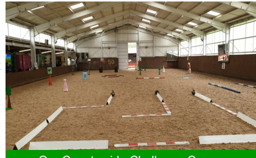
Our Countryside Challenge Course

obstacles! Steering, balance and confidence were all put to the test.