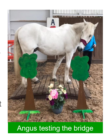
Registered Charity Number 1140330

was, in a small way, to introduce elements in a safe environment that could be encountered on a countryside ride, from the aforementioned animals to gates, arches, bridges and a maze. Our ponies, as always, just took it in their stride and soon worked out that they couldn't eat the artificial flowers and leaves!