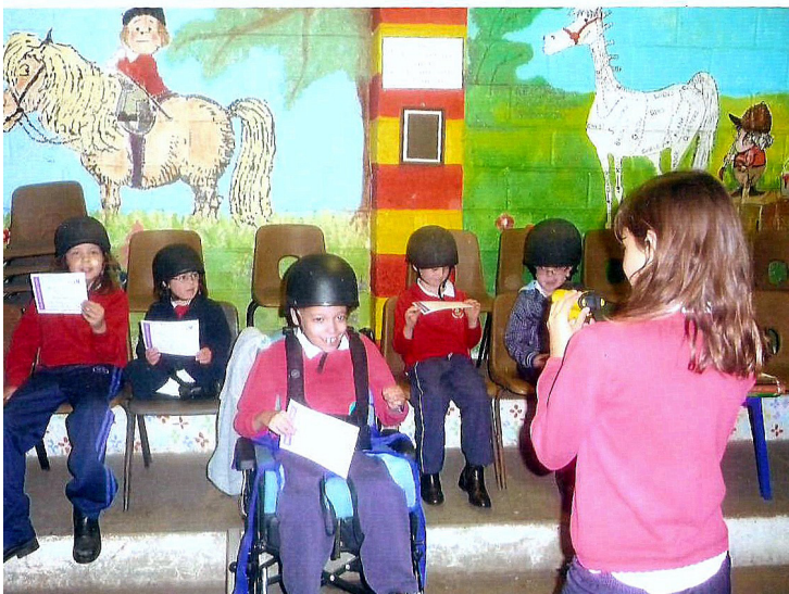
Pictured above are the Bramingham School riders with their certificates * * * * *